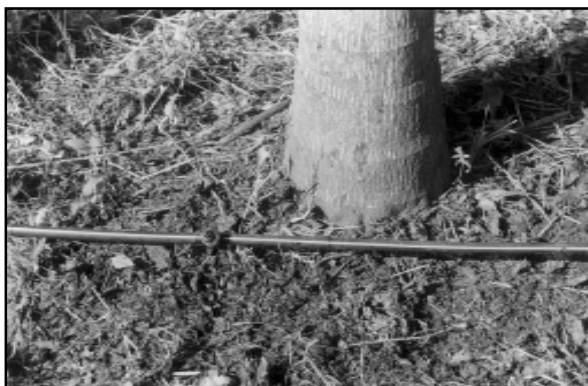
Drip Installed under a Arecanut Tree

Initially two 8 LPH drippers are provided per palm to irrigate 16 litres / day / plant. If intercrops or mixed crop of pepper or betel vine are present, the water delivery is adjusted to meet the demand of those crops also. From the 10th year onwards an additional dripper (8 LPH) is added per palm.